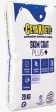
SKIM COAT PLUS+