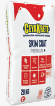
SKIM COAT PREMIUM+