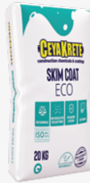
SKIM COAT ECO

Can be used for patching hairline cracks and repairing damage to plaster or paint work. It can be used immediately by adding water.